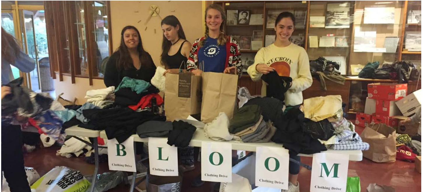
Teens sort donated clothes from County of Marin employees for Bloom, a San Rafael nonprofit that helps clients move toward self-reliance.

Student interns on the Marin Teen Girl Ambassadors team recently completed a special project that helps people working their way toward financial independence.