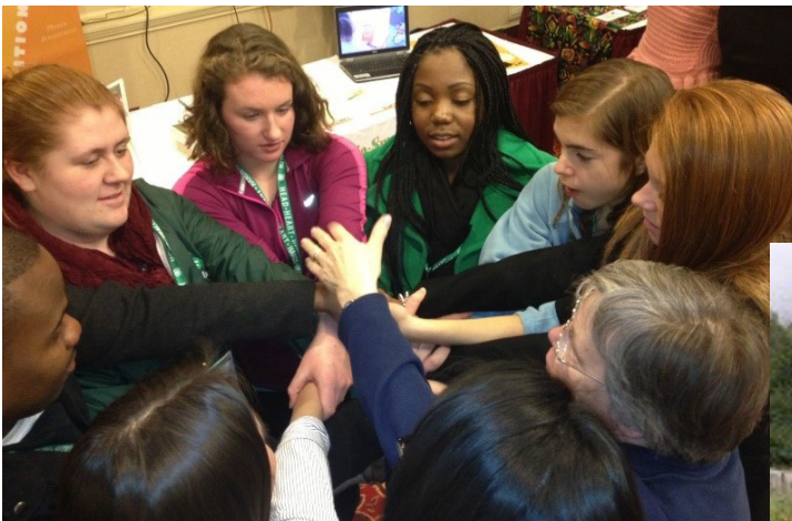
Point Reyes 4-H Club members participate in leadership training, District of Columbia, 2014