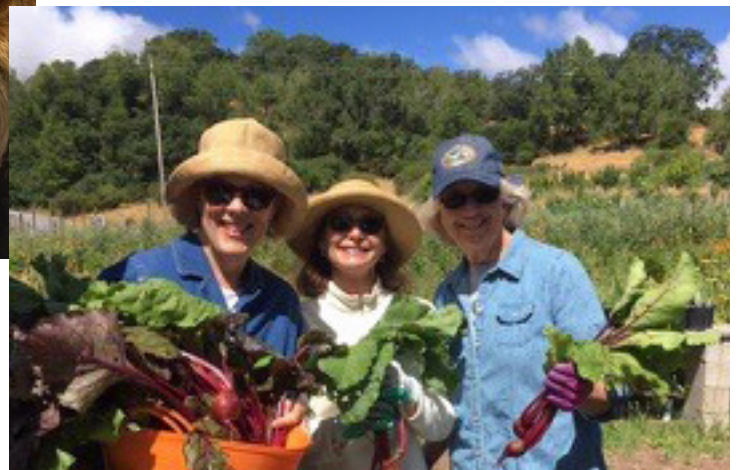
UC Marin Master Gardeners teach how to grow and harvest vegetables at Indian Valley Organic Farm and Garden, 2018