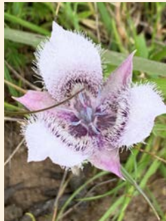
Oakland star tulip

Visit the Ring Mountain Preserve on weekends from April to June.