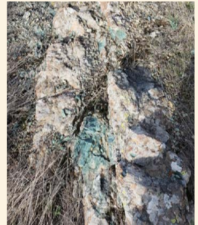
Ring Mountain Preserve rock with serpentine (blue)